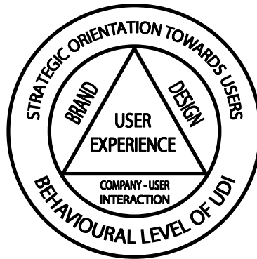
Figure 2: Creating user experience as multidisciplinary process

with a user as an active contributor, the implementation of UDI methodologies will be partial and incomplete. Figure 2 is a representation of different perspectives on creating user experience. UDI methodologies (behavioural level) are supported by strategic orientation towards users. In addition to the methodologies, the UDI process also includes other fields, such as design, branding and company-user interaction, in order to create a desirable user experience.